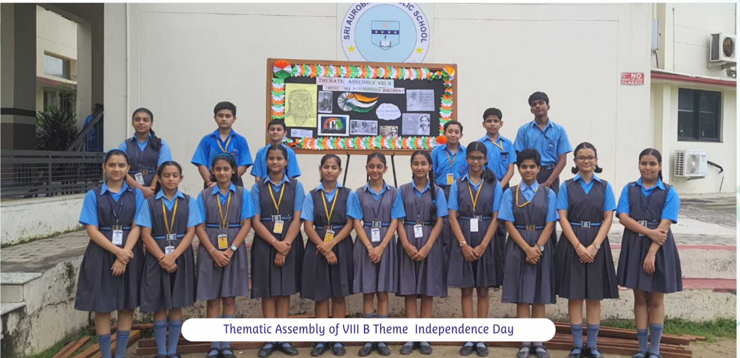
Thematic Assembly of VIII B Theme Independence Day