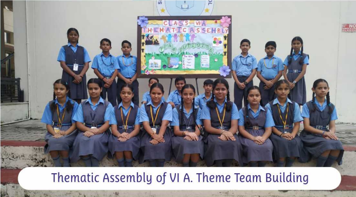
Thematic Assembly of VI A. Theme Team Building

Thematic: Class VI B Theme: Importance of Focus