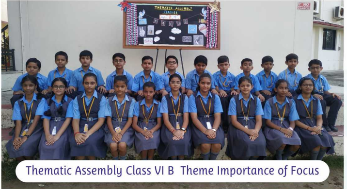
Thematic Assembly Class VI B Theme Importance of Focus